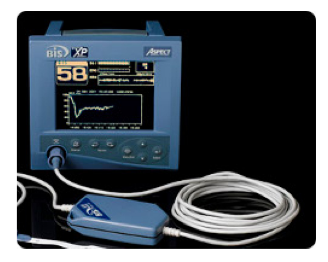
Figure 2. Bispectral index uses processed electroencephalogram signals to measure the depth of sedation on a scale from 0 to 100 (0—coma, 40–60 general anesthesia, 60–90 sedated, 100-awake).