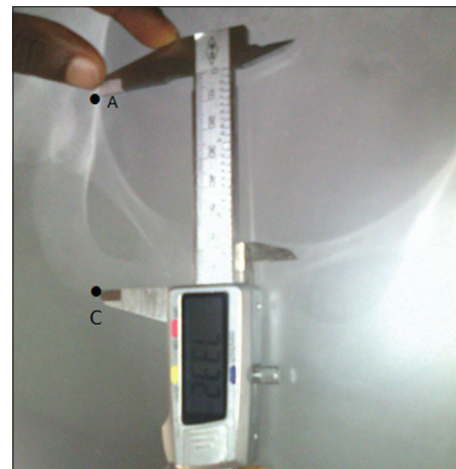
Figure 2: Measurement of ischial length (AC)