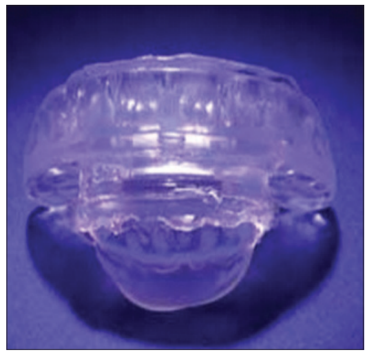
Figure 2: Snore guard

After the tooth preparation is done for fixed prosthesis, provisional restoration is advocated to prevent the events like pulpal inflammation (pulp protection), mesial