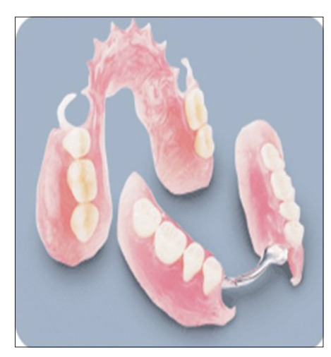
Figure 3: An interim denture

Some authors advised to retain the stumps beneath the artificial teeth, and stated that these roots maintain the alveolar bone health and height for longer duration. This can be achieved by fabricating an overdenture. This can be advantageous in terms of conserving the natural teeth, reducing the rate of residual ridge resorption, proprioceptive feedback by existing periodontal ligaments and thus controlling the occlusive forces and preventing the rapid residual ridge resorption. [36]