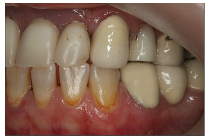
Figure 8: Definitive view of the repaired restoration

In all cases, after the repair process, composite surface was polished using a two-step polishing system (Engance<sup>®</sup> and PoGo<sup>®</sup>, Dentsply Caulk, Milford, DE, USA). The quality of the polishing technique affects the longevity and esthetic appearance of dental materials.<sup>[23]</sup> High-quality polishing improve both the esthetics and the longevity of composite restorations. In addition, poorly polished surfaces contribute to plaque accumulation, gingival irritation and discoloration of the restoration that may lead to patient dissatisfaction and additional expense for a replacement.<sup>[24,25]</sup>