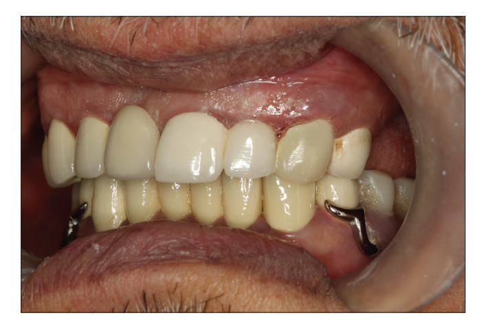
Figure 6: Definitive aspect of the repaired restoration