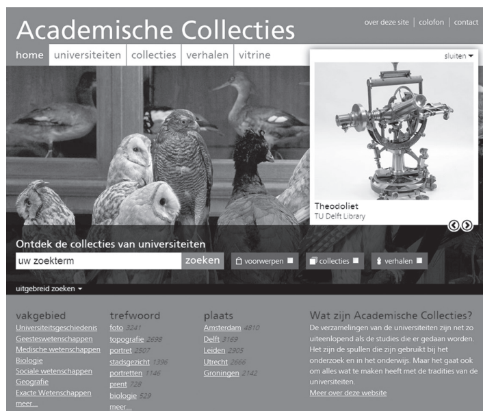
Fig. 1: www.academischecollecties.nl .

of the universities. Examples are, for instance, historic microscopes, anatomical models or photographs. In addition, faculty archives, and paintings belonging to universities, as well as rare book collections are part of the academic collections. Because of this diversity, the portal presents both academic archives and museum and library collections.