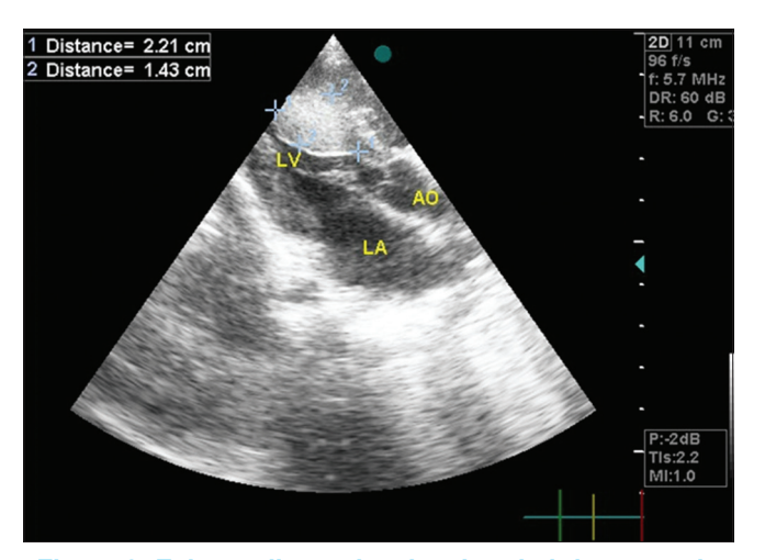
Figure 2: Echocardiography showing rhabdomyoma in left ventricular cavity 21 mm × 15 mm size

neurological dysfunction.[1] Two genes responsible for TSC are TSC1 at chromosome 9q34 (hamartin) and