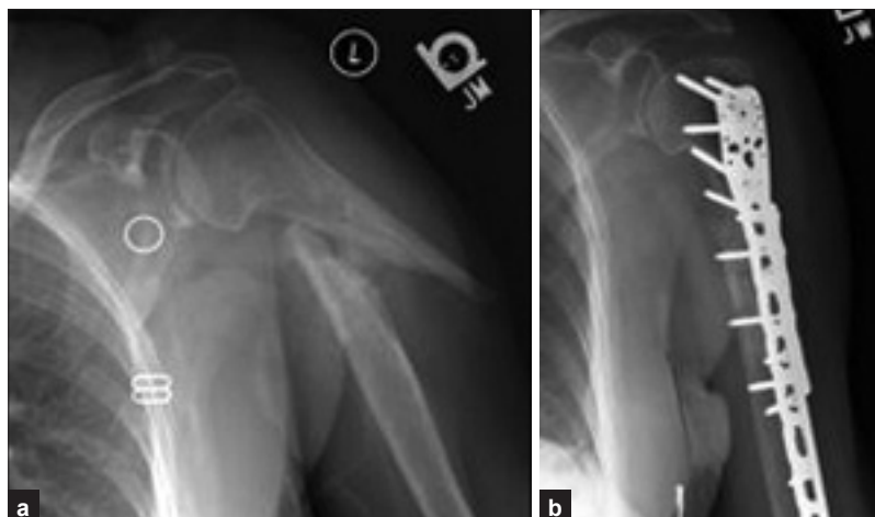
Figure 1: (a) Pre- and (b) post-operative radiographs of patient #1