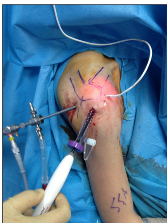
Figure 1: Standard two arthroscopic portals were used in all cases, and fiber-optic temperature probe was placed in the subacromial bursa through an extra anterior portal

Temperatures above 45^\circ\text{C} can cause nerve and muscle damage, and deemed potentially unsafe for the arthroscopic shoulder surgery. [4] The presented study shows that warming the irrigation fluid at the actual shoulder temperature ( 34^\circ\text{C} ) does not raise the subacromial temperature to harmful levels while using bipolar RF device. It can be regarded as an additional measure to prevent hypothermia. A positive correlation between the baseline temperature and maximum temperature in both groups was observed. The higher baseline temperatures appear