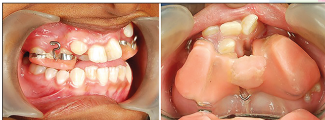
Figure 4: Rapid maxillary expansion appliance with hooks for facemask therapy