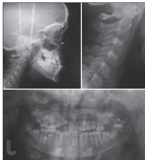
Figure 3: Pre-treatment radiographs

IMPA: Incisor mandibular plane angle, FMPA: Frankfort mandibular plane angle