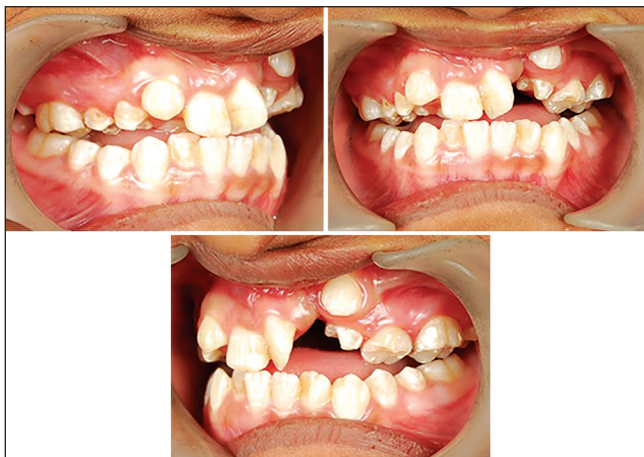
Figure 6: Intraoral photographs after rapid maxillary expansion and facemask therapy