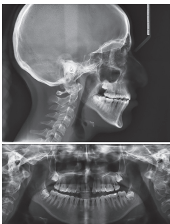
Figure 10: Post deboned radiographs

maxilla can be seen. This means maxillary posterior region moves downward leading to clockwise rotation of mandible and opening of mandibular plane angle [Table 1]. As in this case RME appliance with an acrylic coverage was used in the posterior region, which prevents maxillary posterior extrusive effect to a certain extent, downward rotation of mandible as a consequence to the expansion per se , would be minimal.