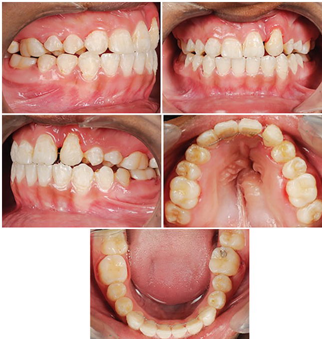
Figure 9: Intraoral post deboned photographs