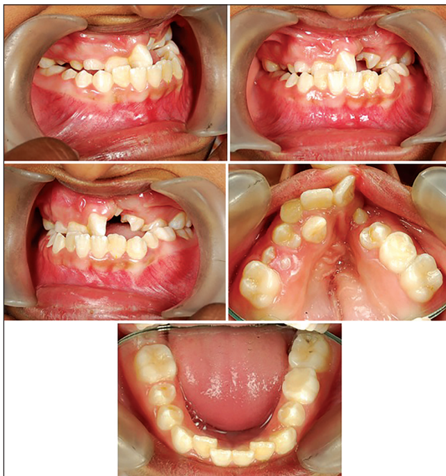
Figure 2: Pre-treatment intraoral photographs