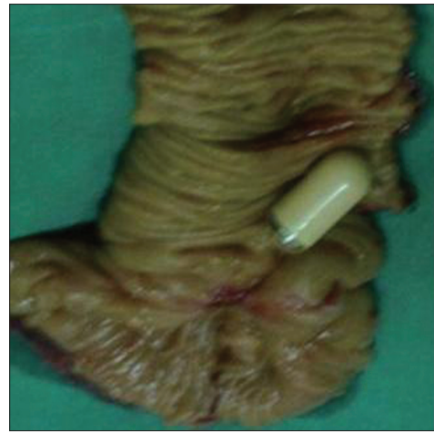
Figure 2: Resected specimen of small bowel with capsule endoscope

Capsule endoscopy has gained widespread acceptance as an important imaging modality for small bowel pathology. The capsule endoscope consists of an 11 mm × 26 mm ingestible endoscope included in which are a wireless video camera, illumination system, batteries, and an image transmitter. Images are recorded by a sensing system worn on the patient's belt which is removed for image download approximately eight hours after capsule ingestion. [2] Seventy-five percent of capsules enter the colon during the eight-hour acquisition time. Subsequently, the disposable plastic-covered capsule is excreted in the stool 10–48 hours later. Indications for capsule endoscopy include obscure gastrointestinal bleeding, suspected inflammatory bowel disease, malabsorptive syndrome, or small intestinal tumors, and surveillance for patients with polyposis syndromes. The list of relative contraindications includes patients with known or suspected GI obstruction, stricture, fistula, or motility disorders, patients with cardiac pacemakers or other implanted electro-medical devices, dysphagia, and pregnancy. [4] The incidence of capsule retention