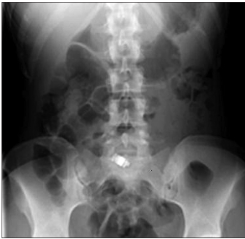
Figure 1: X-ray abdomen showing small bowel obstruction

strictured bowel was noted with the capsule endoscope occluding the bowel at the proximal end of the stricture [Figure 2]. The strictured segment along with capsule endoscope was resected and normal appearing distal and proximal bowel were anastomosed. Histopathology of the resected specimen showed inflammatory infiltration of the wall with fibrosis of the muscularis propria, suggestive of non specific chronic inflammation. There was no evidence of granulomata, crypt abscesses, or malignancy. The images from the operatively retrieved capsule endoscope were analyzed; they showed multiple angiodysplastic lesions in the proximal small bowel. The patient's post operative period was uneventful and was discharged on the 8 th post operative day.