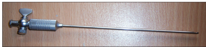
Figure 2: Veress needle

which is used primarily to achieve pneumoperitoneum during laparoscopic surgery. It is also useful in laparoscopic port closure as well as ovarian cyst drainage. The veress needle is autoclavable and will be a cheaper alternative to standard disposable aspiration/drainage devices. Certainly, under ultrasound guidance the needle can be passed into the cavity without the need for laparoscopy. It will also be more effective than the use of intravenous cannula (which has been described in our region) [3] because of its bigger caliber and its longer length.