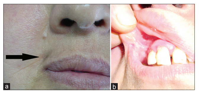
Figure 1: (a,b) A 56-year-old woman presented with a scar in the right upper gingivobuccal sulcus, involving the right commissure of the mouth