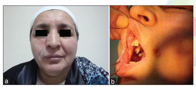
Figure 3: (a) Early postoperative result at one month. Some edema is present around the modiolus. (b) The appearance of the flap in the mouth was considered to be satisfactory

The main advantages of the flap in facial reconstruction are its accessibility, ease of dissection, good color match, and minimal donor site morbidity. Evaluation of the depth of the sulcus is important for the mobility of the tongue, which is paramount in proper speech, therefore, integrity of the sulcus and sufficient reconstruction is necessary.