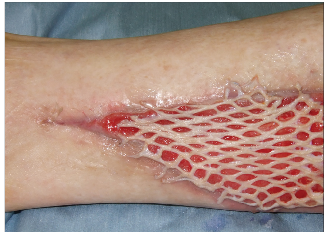
Figure 2: The dendritics of the mesh skin graft were affixed using Dermabond

We used Dermabond for the pasting of meshed skin grafts. This technique spares the dendritics, which are usually trimmed or useless. The fixation time is equivalent to surgical stapler fixation and the removal of sutures is