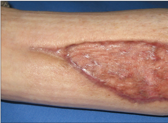
Figure 3: Six-month postoperative result

Dermabond was initially used to replace the suturing of superficial wounds, but it is currently used in a variety of techniques. [1] Dermabond has been used recently as a skin bolster to assist the primary closure of wounds in patients with thin skin. [2]