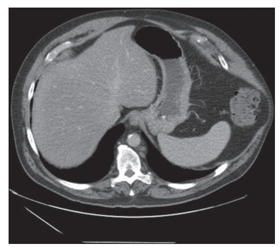
Figure 2: CT of abdomen 10 months after hospital discharge shows left side chest wall hernia through the torn intercostal muscles

Intercostal hernias may develop either acutely or over a number of years. Intercostal muscles can tear or underlying ribs can even fracture after severe chronic coughing. The intra-abdominal and intrathoracic positive pressure that