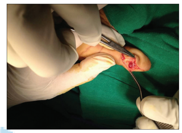
Figure 4: Tumor at the tip of right thumb