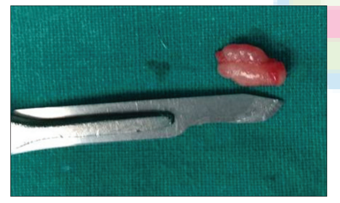
Figure 5: Excised glomus tumour

especially under the nail. So, the tumors are usually in the subungual area. The glomus tumor being located in the volar pulp of the distal phalanx is very rare.