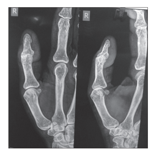
Figure 1: Radiograph-anteropsterior and lateral view