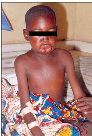
Figure 1: 10-year-old Fulani herds' boy with posterior neck viper bite and coagulopathy, severe edema of the scalp, face, and chest

The leading edges of the swelling were marked with pen for monitoring progression while vital signs and signs of neurotoxicity (dysphagia, dyspnea, and muscle weakness) were monitored. The 20 min whole blood