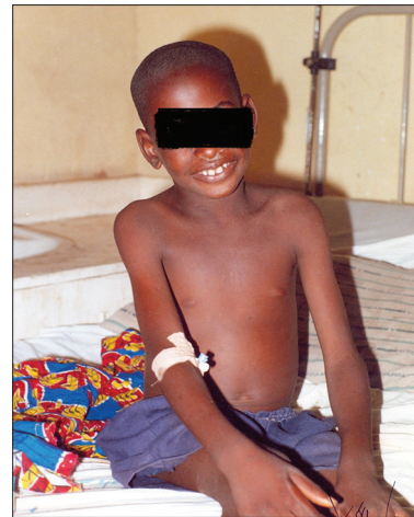
Figure 2: Six days after commencement of treatment

Snakebite first aid include reassuring the victim and ensuring that the victim's affected limb is immobilized with splint or sling to reduce toxin dissemination. [2] To