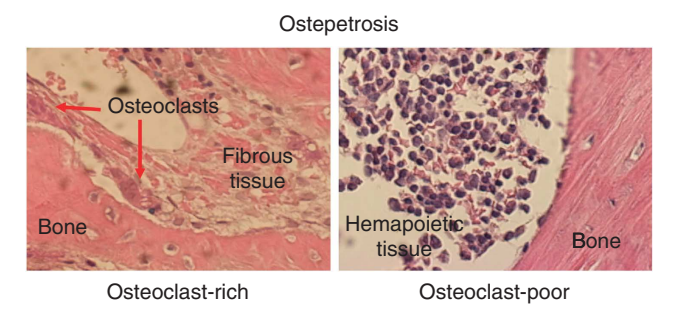
Figure 1 Hematopoiesis in osteopetrosis. Histological sections of bone biopsies of patients affected by osteoclast-rich and osteoclast-poor osteopetrosis showing abnormal fibrous tissue in the former and hematopoietic tissue in the latter. Hematoxylin/eosin

osteopetrosis.<sup>18,19</sup> In fact, pathological examination of the bone biopsies of osteoclast-rich osteopetrotic patients refer to 'irregular and massive primary trabeculae surrounded by abnormal fibrous tissue'.<sup>20,21</sup> In contrast, Sobacchi et al. <sup>22</sup> and Guerrini et al. <sup>23</sup> showed a few bone biopsies of osteoclast-poor patients, describing the presence of scant hematopoietic tissue in small medullary spaces, with, however, no fibrosis ( Figure 1 ). As most hallmarks of the two forms of osteopetrosis are very similar except for the presence of high number of osteoclasts versus their absence, it is worth to hypothesize that, at least in this pathological condition, nonfunctional osteoclasts may contribute to the development of fibrosis, possibly inhibiting hematopoiesis.