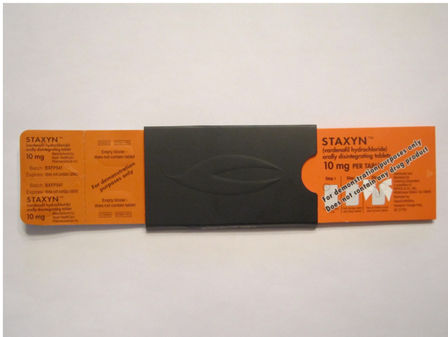
Figure 2. Vardenafil ODT (Staxyn) foil wrapped medication pockets can be seen extended out from the main cover.

crete package resembling a package of gum (Fig. 1). Additionally, the medication is foil-wrapped to prevent moisture and medication dissolving (Fig. 2). Anecdotally, men have commented that they feel more comfortable taking this medication at dinner, without feeling the need to hide the medication. Ultimately, the orodispersible vardenafil offers patients an alternate option but does not dramatically differ from film-coated varieties.