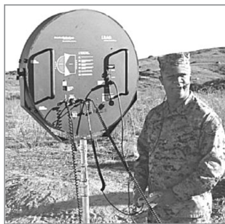
Figure 4. The operator side of the LRAD