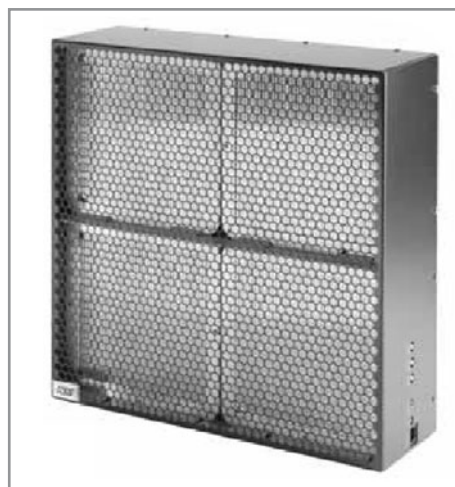
Figure 3. HSS loudspeaker with protective grid

Current development is through a million dollar contract, in order to supply a field device which can defuse potentially dangerous situations by sending instructions and information from a distance. And if the instructions are ignored, the switch can be flicked to the behaviour-influencing warning tone. Of course, if the object of the beam copies the LRAD operator and wears hearing protection, the effectiveness is reduced.