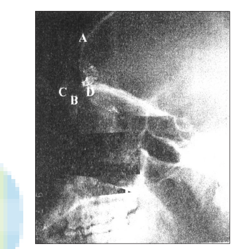
Figure 1: A plate showing land-marks used for measurement of Length (AB), Depth (CD) of frontal sinus. A = Apex of Sinus. B = Roof of Orbit C = Anterior Table D = Posterior Table

The relationship between sex and height of the frontal sinus was shown in Table 1. The data showed that the null