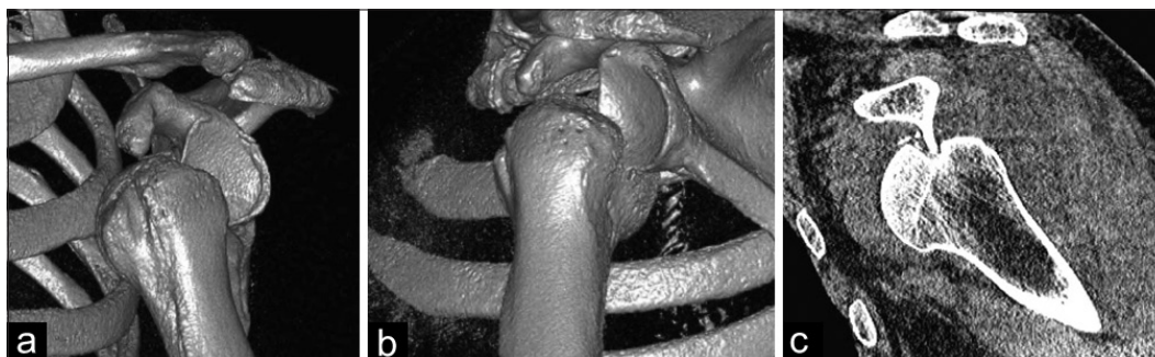
Figure 2(a-c): Assisted computer tomography with three-dimensional reconstruction showing an anterior sub-coracoid dislocated left shoulder with humeral head impacted on antero-inferior rim of glenoid