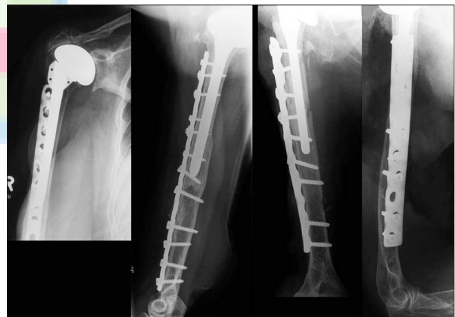
Figure 3: Patient one and two, two years after open reduction and internal fixation with the periprosthetic combination of 3.5 cortical screws with washers and 4.5 plates

no cement at the fracture site. Open reduction and fixation allows the patient to achieve prefracture-level mobility faster than the conservative treatment approach. The main problems encountered in the elderly patients while administering the operative treatment approach are the poor bone quality and the periprosthetic fixation.