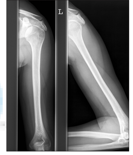
Figure 4: X-ray of the lesion 1 year after diagnosis and conservative treatment, showing complete resolution

ossificans circumscripta without history of trauma (non-traumatic MOC) usually occurs in patients with hemophilia, paraplegia or poliomyelitis, chronic infections, burns or severe head injuries. Non-traumatic MOC can also occur independent of these conditions.