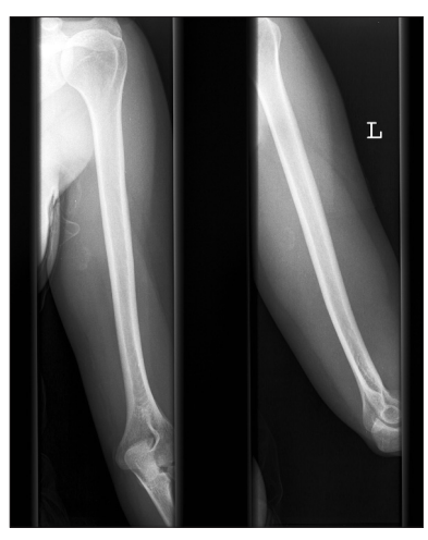
Figure 1: Anteroposterior and lateral X-ray at first presentation showing that the lesion is located posteromedially of the midshaft of the upper arm. The lesion is characterized by a sharply demarcated and partially mineralized periphery