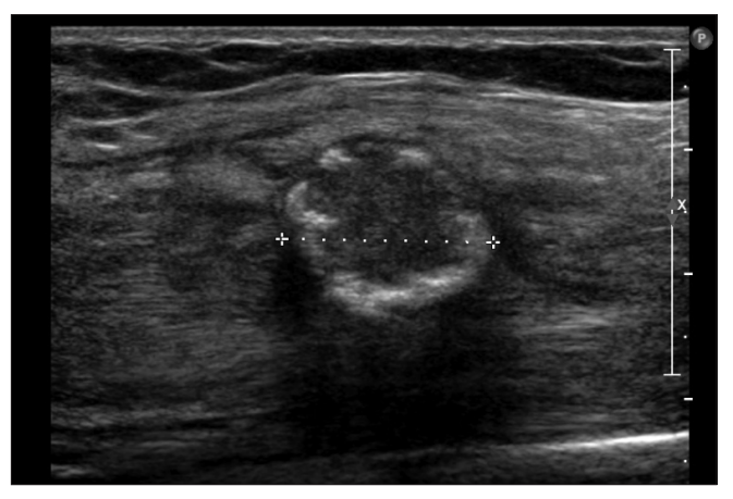
Figure 2: Initial ultrasound confirmed the peripheral calcification of the lesion in the medial caput of the triceps. The diameter of the lesion was 1.7 cm

MO can be classified into three types using the classification of Noble:<sup>[1]</sup> 1) Myositis ossificans progressiva or fibrodysplasia progressiva (FOP) is a severe, hereditary metabolic disorder. It appears in children<sup>[1]</sup> and is characterized by a diffuse and generalized metamorphosis of muscle into bone, but with a fatal outcome. 2) Traumatic myositis ossificans circumscripta (traumatic MOC) follows a local acute or chronic trauma, a repetitive trauma or chronic overuse in sports. 3) Myositis