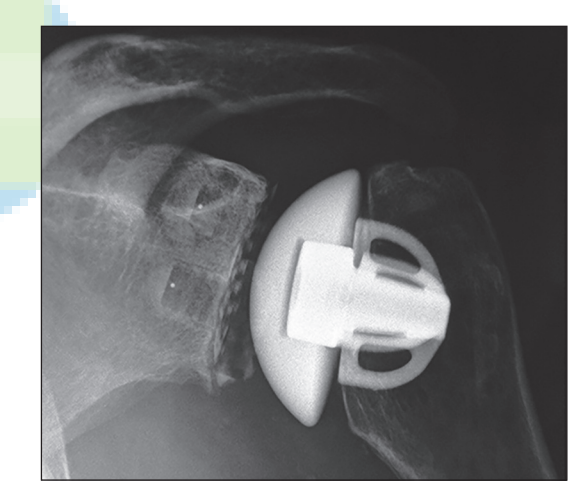
Figure 3: X-ray 2 years post-operative of an arthroplasty

Complications were few, and none related to the prosthesis. There were no infections, fractures, or any instability. Four patients developed acromioclavicular (AC) joint pain months following the replacement. Two of these patients had an AC joint cortisone injection, and finally, the pain resolved in all patients. There were several further problems. There were two transient partial musculocutaneous nerve palsies, one olecranon bursitis, and two skin reactions to the dressings, all of which resolved over time.