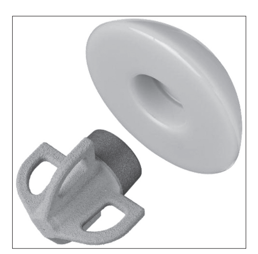
Figure 1: Photograph of short stem and ceramic head

The glenoid was then prepared in a standard manner for the Affinis double pegged glenoid prosthesis, which has been described previously.<sup>[4]</sup> The appropriate size glenoid prosthesis was then cemented into position with pressure injected cement.