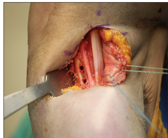
Figure 1: Pectoralis major tendon held with two #2 Fiber wire® (Arthrex, Inc., Naples, FL, USA) locked sutures in a Krackow fashion. The humeral insertion site was properly prepared, creating a trough with a rounded burr at the anatomic insertion site, lateral to the biceps tendon