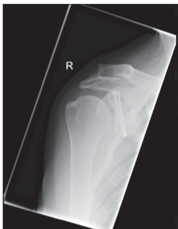
Figure 5: X-rays taken 7 weeks postoperatively show a well-united fracture with adequate articular reduction. Anteroposterior radiograph 7 weeks postoperative