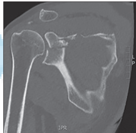
Figure 2: Coronal computed tomography scan image of the right shoulder revealing a 5 mm intra-articular step in the glenoid surface

The CT scan had identified the major articular fragment to be continuous with the coracoid. The decision was made to use the coracoid as a joystick to aid indirect reduction. A 3 cm longitudinal skin incision was made directly over the coracoid process. The deltopectoral interval was carefully opened whilst protecting the cephalic vein. The coracoid was then held with a pointed reduction clamp and used as a joystick to manipulate and indirectly reduce the articular surface. Reduction was confirmed with direct visualization of the glenoid via the arthroscope [Figure 4]. A Neviaser's portal was created, and blunt dissection was done down to the glenoid neck. Care was taken not to dissect 1 cm medial to the glenoid neck to avoid suprascapular nerve injury. Two 1.8 mm guide wires were passed through this portal and across the fracture site, under image intensifier guidance. The reduction was monitored using the arthroscope throughout. Intra-articular guide wire penetration was ruled out arthroscopically and radiologically. Care was taken while inserting the guide wires not to progress the wires beyond the inferior cortex of the glenoid neck to avoid injury to the axillary nerve. Two self-drilling and self-tapping BIOMET® UK Ltd (Biomet, Swindon, UK) 4.5 mm cannulated