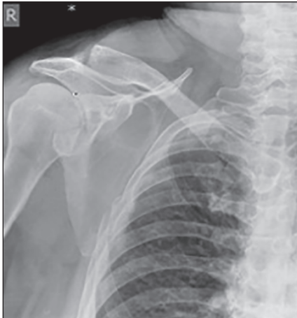
Figure 1: Anteroposterior radiograph of the right shoulder showing a displaced Ideberg type III fracture of the glenoid, with some ipsilateral rib fractures

Preliminary radiographs were taken prior to draping to confirm adequate visualization of the glenoid. A posterior portal was used as a viewing portal. The hematoma was evacuated with saline lavage and the fracture identified. An additional anterior working portal was used to evaluate the intra-articular structures. No cannulae were used. The large articular step was visualized, and mobility of the fracture was confirmed with an arthroscopy hook [Figure 3]. The rotator cuff and biceps were visualized. The biceps tendon was frayed and, therefore, a biceps tenotomy was performed. This highlights the advantage of identifying and potentially treating concurrent intra-articular glenohumeral joint pathology when using an arthroscopic technique.