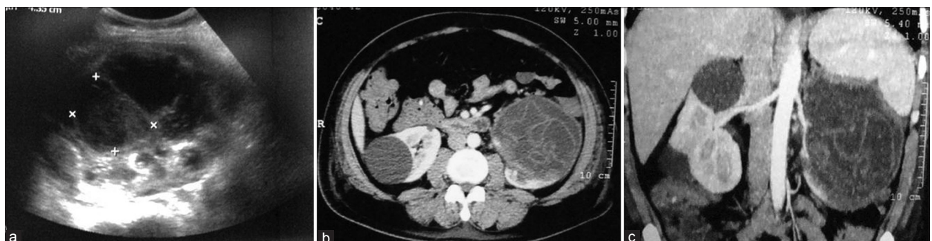
Figure 1: (a) USG showing multilocular hydatid cyst. (b and c) CECT showing left renal hydatid with multiple daughter cysts