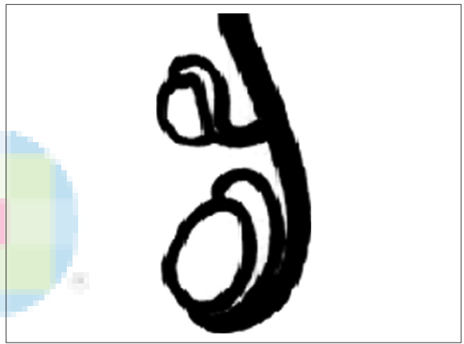
Figure 4: Type-III: The supernumerary testis has its own epididymis and both epididymis of the ipsilateral testes draining into one vas. (Complete transverse division of mesonephros as well as genital ridge)