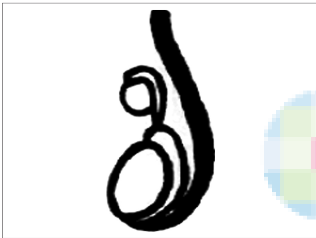
Figure 3: Type-II: The supernumerary testis drains into epididymis of usual testis and they share a common vas. (Division of genital ridge occurs in the region where the primordial gonads are attached to the metanephric ducts, although the mesonephros and metanephric ducts are not divided, i.e., incomplete division)