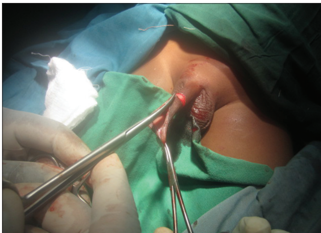
Figure 5: Dorsal slit