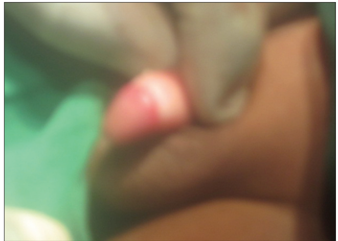
Figure 2: Glans penis freed and prepuce everted