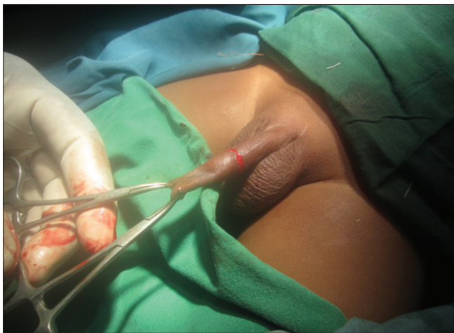
Figure 3: Circumferential knife skin mark