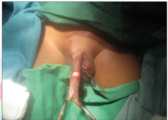
Figure 4: Crushed prepuce dorsally