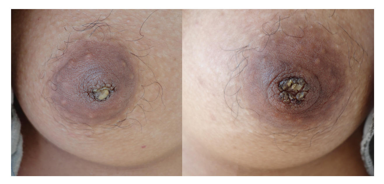
Figure 1. Bilateral involvement of the nipple.

in men receiving hormonal therapy, but is also found out of this context.<sup>2</sup> The distribution is typically bilateral, but can be unilateral.<sup>4</sup> NHNA is clinically characterized by verrucous thickening and pigmentation of the nipple and/or areola.<sup>4</sup> Diagnosis is confirmed by histology; the main features include hyperkeratosis, acanthosis, and papillomatosis, which closely mimics symptoms of epidermal nevus or acanthosis