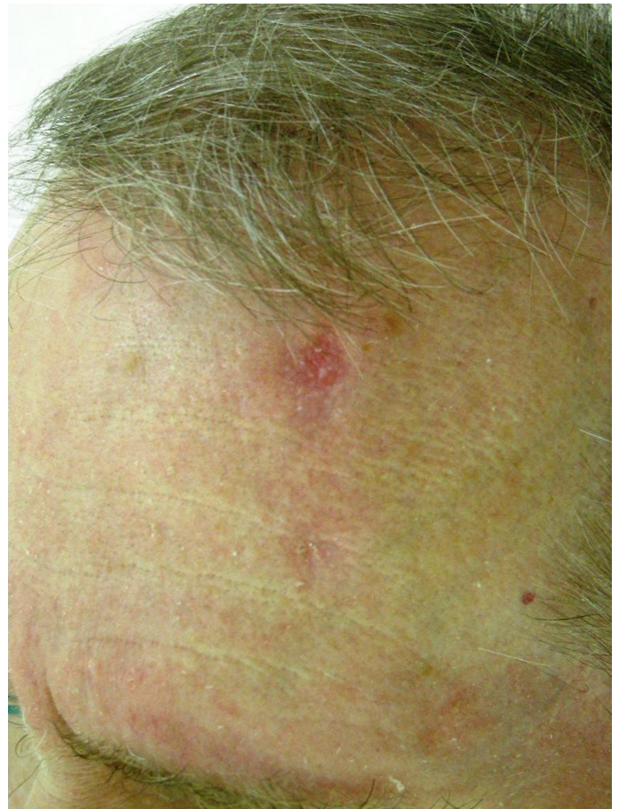
Figure 1. A 57 years old male, presented with two erythematous scaly papules in the left side of the forehead. Skin biopsies of both lesions showed upper nodular and lower infiltrative type basal cell carcinomas. Both lesions are lined up in a vertical position.

A 57 years old male presented with two erythematous scaly papules in the left side of the forehead. They were lined in a vertical position (Fig. 1). The upper one measured 1.1 cm × 1.5 cm while the lower one measured 1.1 cm × 1.3 cm. Skin biopsies revealed