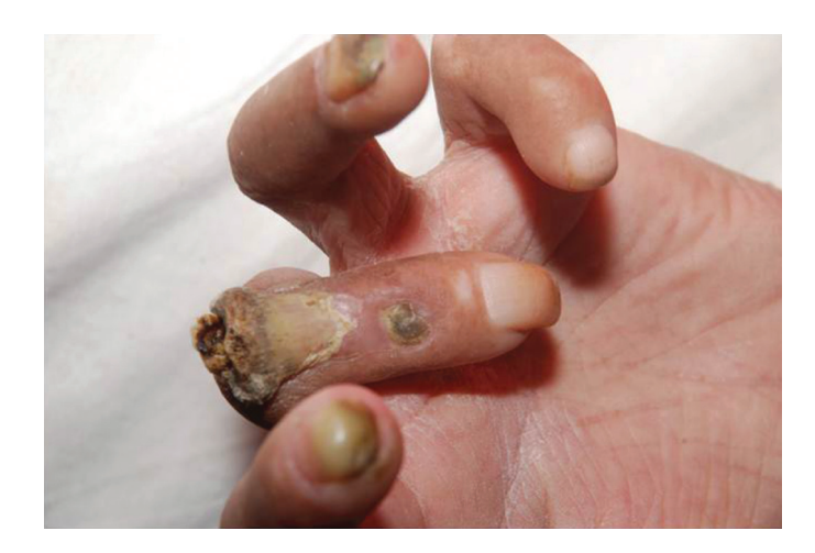
Figure 1. Clinical picture of patient (A) and picture of the left hand showing ectopic nail (B).

Laboratory examination revealed Hb = 9.3 gm/dL, TLC = 13900/ \mu L with 92% of neutrophil count. Anti-nuclear antibody was found negative. Lung spirometry test showed the moderate restrictive airways pattern. X-ray chest showed the thickened horizontal fissure and reticulonodular shadow on right mid and bilateral lower zone (Fig. 2A). All these observation made us to diagnose the patient as a case of systemic sclerosis.