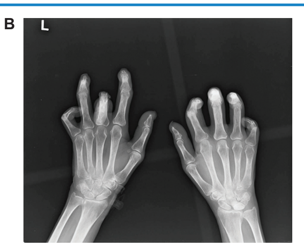
Figure 2. X-ray of the chest (A) and hand (B).