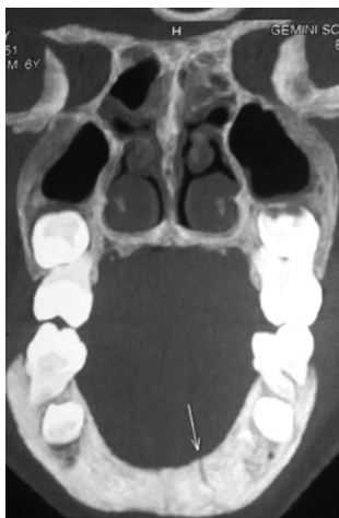
Figure 1: Coronal facial computed tomography depicting fractured mandible symphysis (arrows)